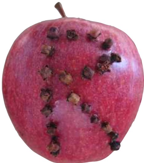
The First Letter of Your Name